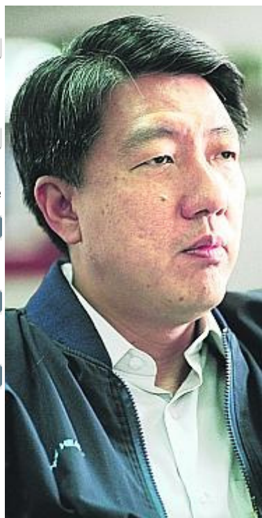
Mr Teo: Stresses the significance of air power in non-combat operations

Conference, the first defence procurement conference to be held at an international air show. Opening the conference, Manpower Minister and Second Defence Minister Ng Eng Hen said 'all governments, big and small, are rightly concerned that their defence procurement processes are efficient and effective'.